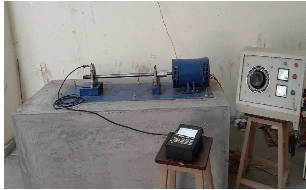
Figure 1. Experimental set up

For the vibration analysis, signals are taken using CoCo-80. It is a portable recorder having feature of dynamic signal analysis and it collects and store vibration data. Signals taken from the recorded is then analyzed using signal processing technique called wavelet transform.