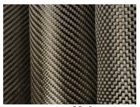
(D) Basalt fiber Mesh