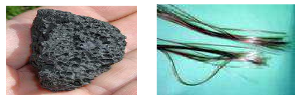
Fig 3. (a) Basalt porous rock formed by lava (b) continues Basalt fibers

Fig.2 Flow chart of basalt fiber production