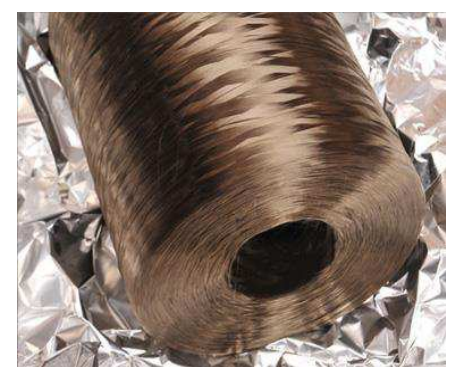
Fig3 (.C) Basalt fiber roving