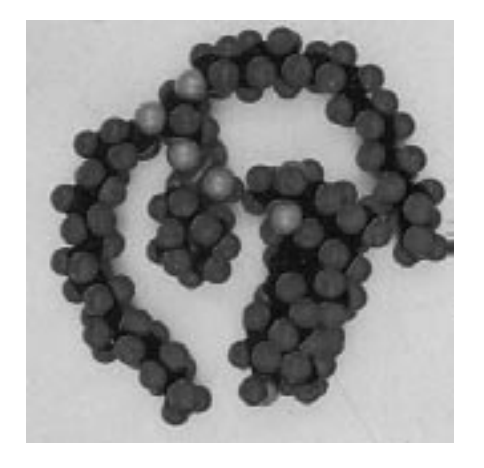
Figure 1: Organization of the phytosome molecular complex. A flavonoid molecule (lower right) is enveloped by a phospholipid molecule.

the gastroprotective property of phosphatidylcholine<sup>6</sup>.