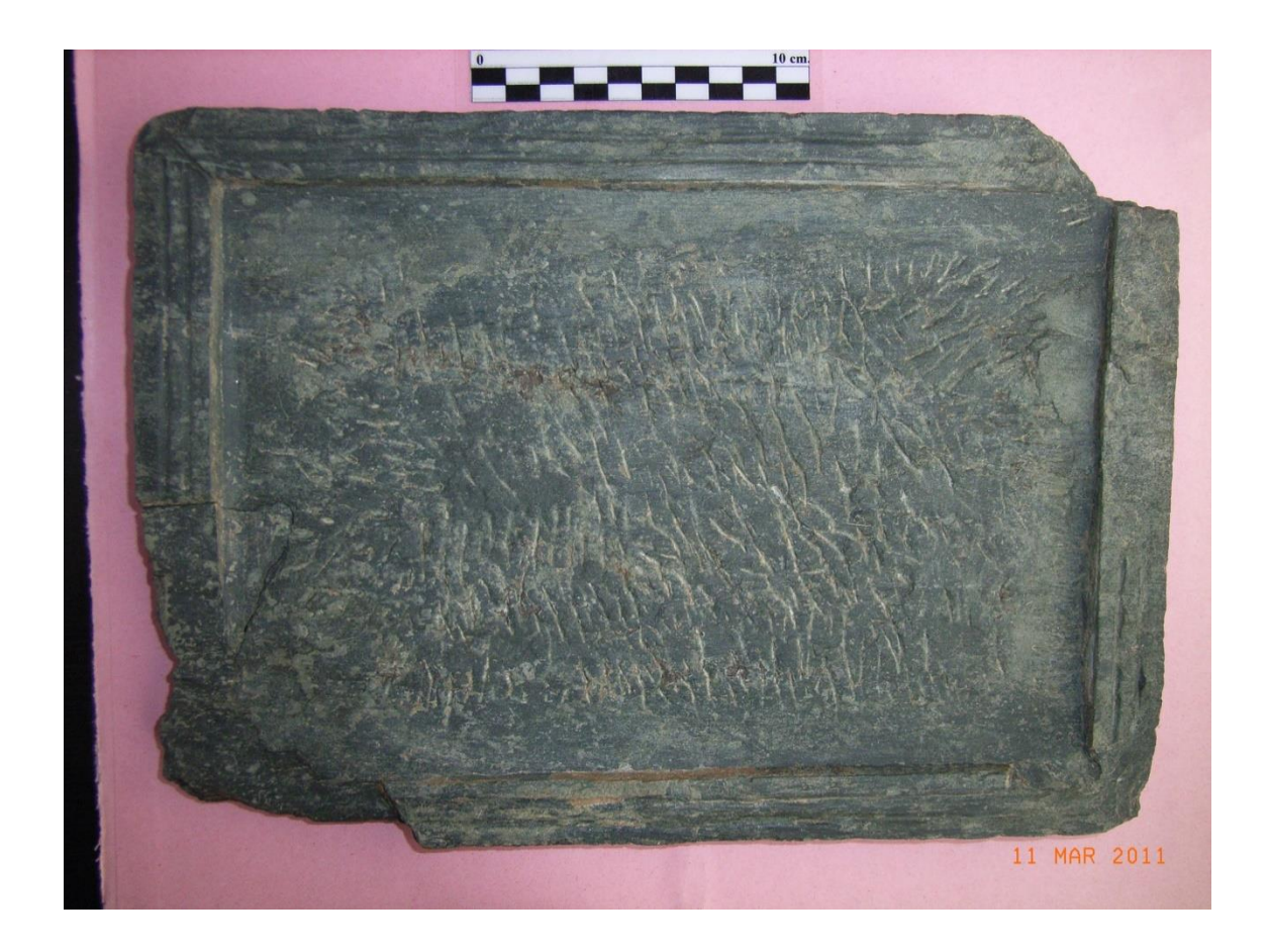
Fig. 3 The Antequera Slate plane photograph showing its dimension and signs incised on it.

It is presently exposed at the Antequera Municipal Museum (Antequera City Town Museum,), This museum is at the Najera Palace (Coso Viejo Sq), It also contains the famous and finest World statue of Roman style human in bronze: "The Antequera Efebus" (1st Century BC, found earthed by a peasant in Antequera surroundings in 20th century).