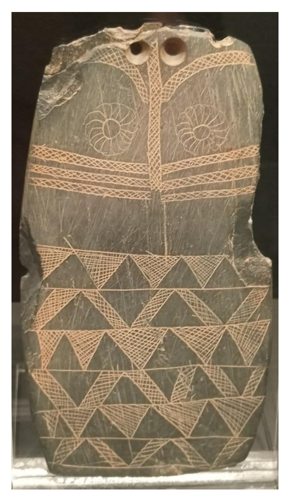
Fig. 6 3,500 years old owl oculated idol from a Dolmen Chamber of Los Gabrieles (Valverde del Camino, Huelva, Spain). Huelva Archaeological Museum.

Villena et al. 1999, Arnaiz-Villena and Alonso-Garcia 2012, Arnaiz-Villena 2000 (Appendix I).