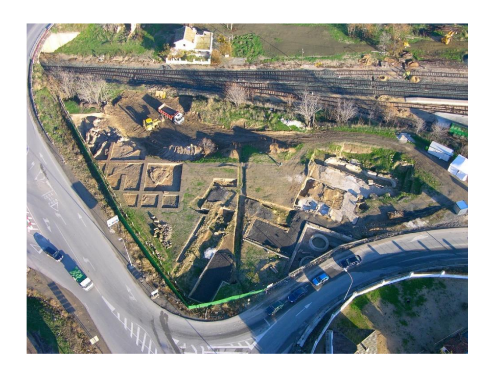
Fig. 2a Aerial view of "Villa de la Estación" located in Antequera, Málaga, Spain excavated by archaeologist Dr Manuel Romero (Romero et al. 2006). Railway and main Antequera roads may have spoiled a part of it.