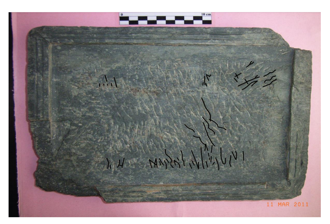
Fig. 4 A part of the repetitive signs were decided to be studied at present and are remarked on the Antequera Slate for better identification. They have been partially studied in present work (see Fig. 5 ).

The Roman "Villa de la Estación" building collapse occurred about 400-450 AD and could occur even some years before. It means that the Antequera Slate had to be engraved and its form carefully sculpted in an uncertain time before . The writing is not neither fully developed Iberian-Tartessian nor Roman. The building may have started to be used between 50-100 AD. It is a type of rich and luxurious construction (Romero et al. , 2006) and in fact, there exist Roman thermal baths close to the building. Slates are easy to obtain in flat pieces from a metamorphic rock which are abundant in Iberia, being Spain in year 2,000 AD the first state exporting country in World (Cárdenes et al. 2019). All Iberian slate beds are in the half western part of Iberia. This is documented in the very ancient occulated slate idols found in Southwest Iberia shown in Huelva and other Spanish and Portuguese museums (5,550-1,750 years BC in the Coper Age and often within a Megalithic context) ( Fig. 6 ). 4,000 of such plaques have been recollected now and many of them from Megalithic tombs (Negro et al. 2022). They may represent female divinities and also the Mother Goddess (Gimbutas 1991). Other more trivial uses than funeral/ritual/religious ones have also been postulated (Negro et al. 2022).