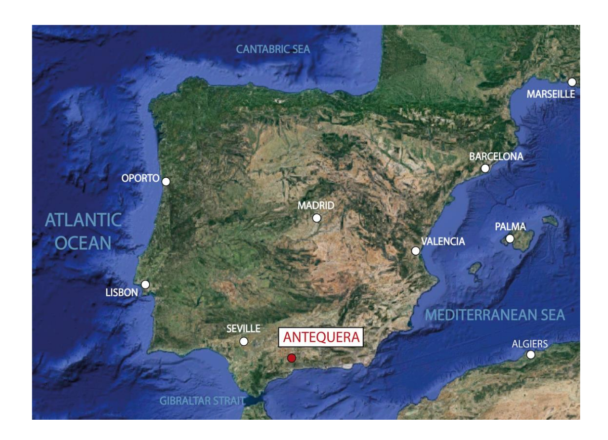
Fig. 1 Map showing the Iberian Peninsula, South France and North Africa. Antequera city is placed in Andalucía, southern Spain, and near other important cities like Malaga, Seville and Granada. The archaeological site "Villa de la Estacion" (Antequera old train station Villa) is the place where this tablet was found (Romero et al. , 2006)