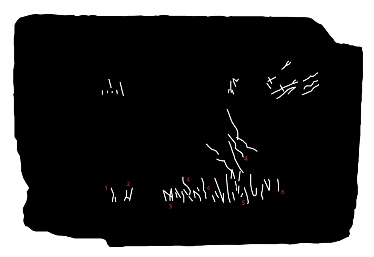
Fig. 5 Signs found on the Antequera Slate remarked in black and white. Numbered signs have been studied and a interpretation proposed is below. Signs are repeated all over the slate, which may be scripted by a right-handed person in a spiral or boustrophedon way. It is not likely that several people wrote in this slate, since signs are not crossed or half deleted by others. See Arnaiz-Villena et al, 1999, Arnaiz-Villena and Alonso-Garcia 2012. These signs are in the Ibero-Tartessian signary (Appendix I) and may represent funerary and religious simple words in a pre-Iberian signary by using Basque-Iberian transcription and translations. These signs are present both in Megaliths and rock and stones of ancient but undefined dating (Arnaiz-Villena et al. 2022a; Arnaiz-Villena and Juarez 2023a). At present, assertion that the Antequera Slate contains Iberian or pre-Iberian signs is yet premature.