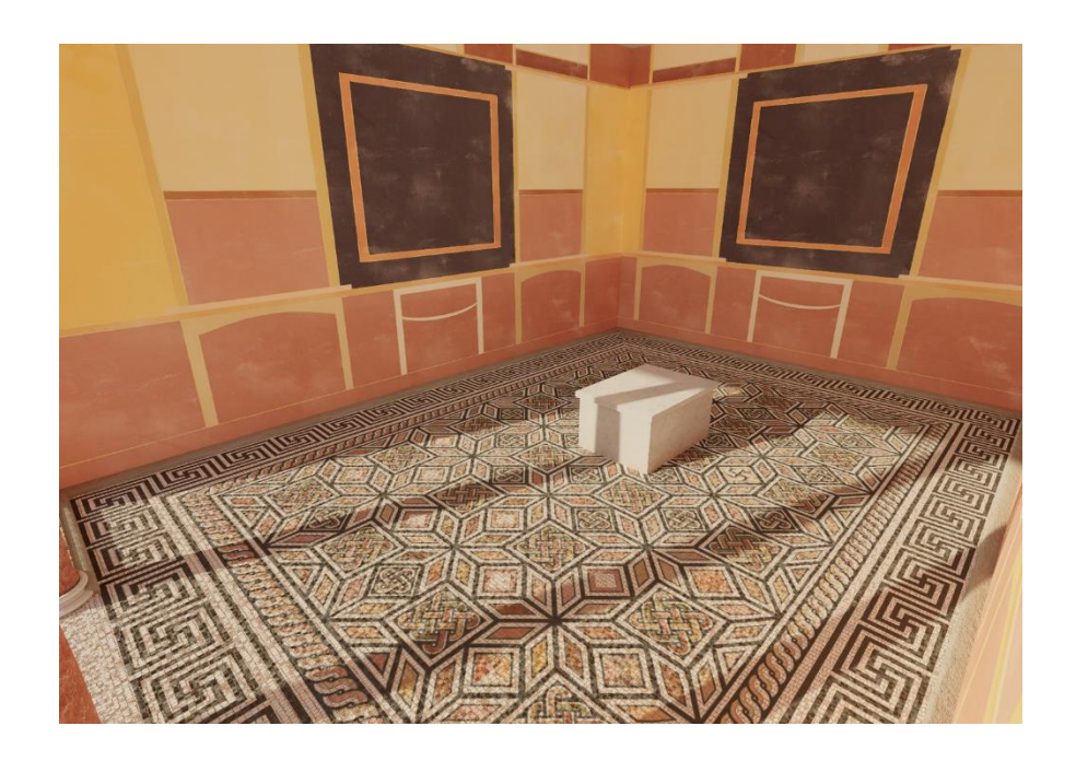
Fig. 2b Reconstruction of Villa de la Estación room where The Antequera Slate (analysed in this work) was found.

It is supposed that in this place were kept old family souvenirs: portraits, paintings and documents also, since another slate piece was found. The photograph is part of a panel of an exhibition at the Villa de la Estacion itself to visit the archaeological discoveries that will open to the public on December 2023.