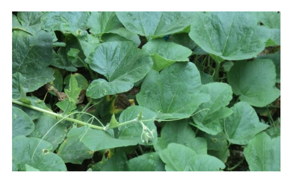
Fig. 5: Elegede Field pumpkin ( Curcubita pepo )

Not all people especially young fathers and mothers claim knowledge of the cause of oka but they all believed it exists and is curable but only with traditional medicine. Both old and young participants irrespective of gender claimed to have experienced oka , either with their own child/ren or through vicarious experiences. Only the older participants claimed to know the causes which were attributed to the diet taken by a pregnant woman. Those foods mentioned were some local vegetables such as elegede Field pumpkin ( Curcubita pepo ) and ebolo Fireweed ( Crassocephalum crepidoides ) see Figs 5 and 6 respectively.