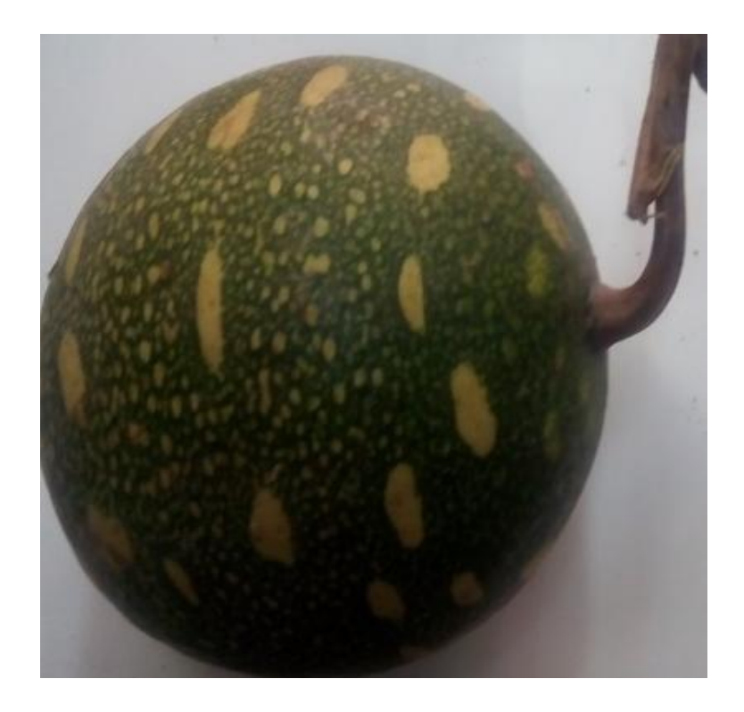
Fig. 4. Tagiri (Adenopus breviflorus)

traditional medicine. Most of the participants acknowledged the efficacy of antibiotics and hospital-based management as the proper treatment option and even condemned some treatment traditional ways of managing the condition virtually all the participants have either managed or preferred to manage measles with ero (local antidote/local herbs). They would also make sure their kids keep a distance away from an infected infant, sprinkling and drinking emu (palm wine), keeping tagiri ( Adenopus breviflorus ) ( Fig. 4 ) at home, and some local leaves as a way of preventing it. Worthy of note is a particular family culturally known for treating sopona (god-inflicted measles) in Akinlalu. Also, apart from the acknowledgment of western medicine, immunization during antenatal care was equally identified as a vital factor in yiyi 's prevention.