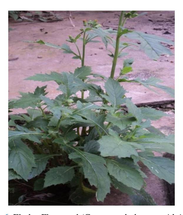
Fig. 6. Ebolo- Fire weed ( Crassocephalum crepidoides )

"In the olden days, before the advent of the hospital, when a woman is pregnant, we had our traditional medicine that our forefathers and foremothers used to. Aseje (herbal meal) will be prepared for a pregnant woman to eat. There is something called oka (sunken fontanel), once a baby has it from the womb there is no type of modern medicine that can be used to treat it; the baby will still be crying and getting smaller daily until agbo (herbal concoction) is prepared by our fathers" (FGD with young mothers).