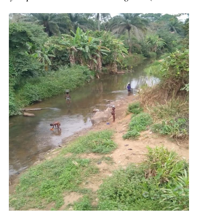
Fig. 2. Opa, a multipurpose river for healing, security, and household usage

People came here from different places and they came with their belief systems....so each quarter worships her gods like sango, oya and so forth. Also, there is Ile oloya up there as well as Ile Alagbaa. (IDI with a 68-year-old man).