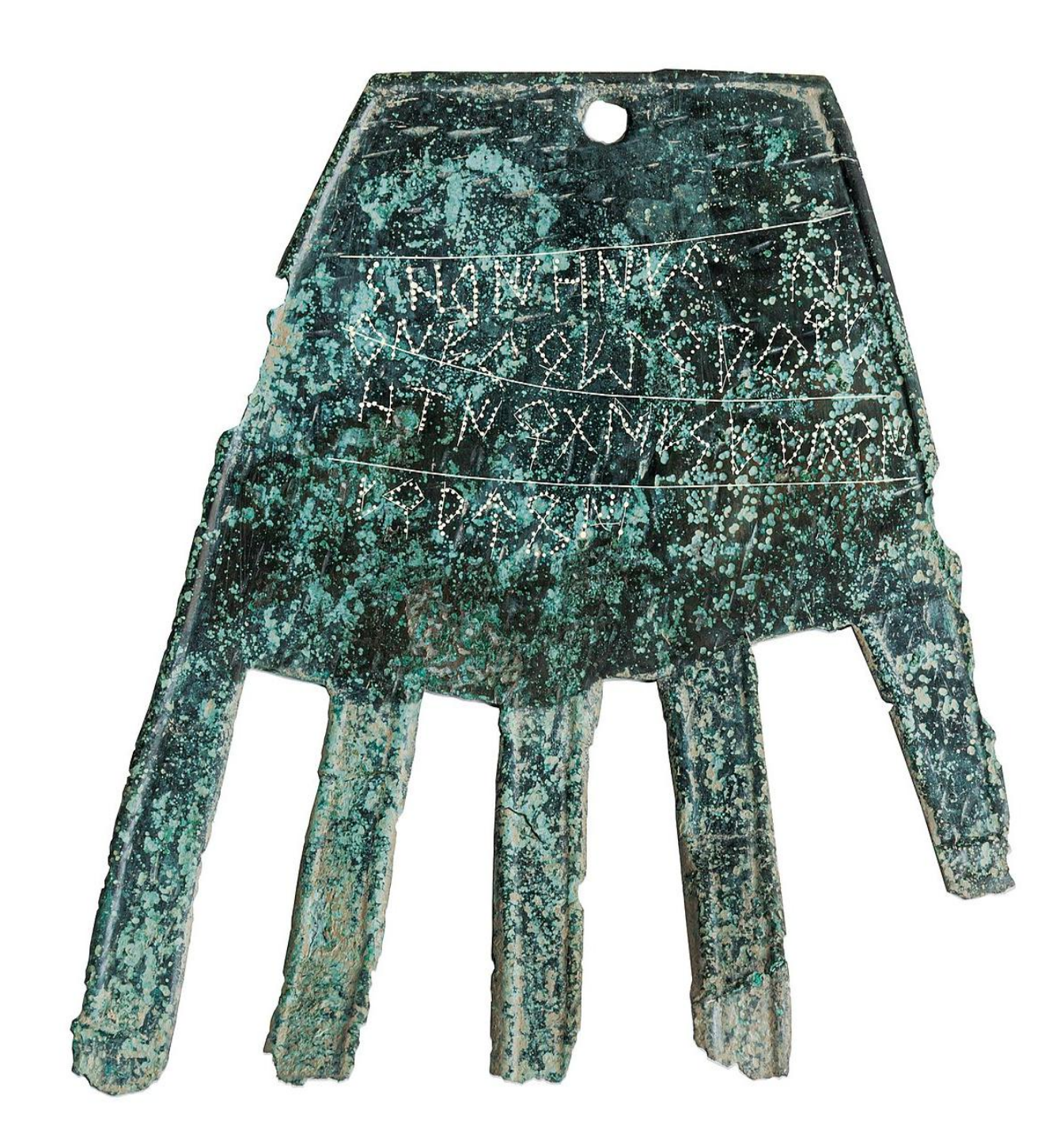
Fig. 2 The Hand of Irulegi. A bronze-based inscription (in the shape of a hand) in Iberian-Tartessian signary (see Fig. 3).