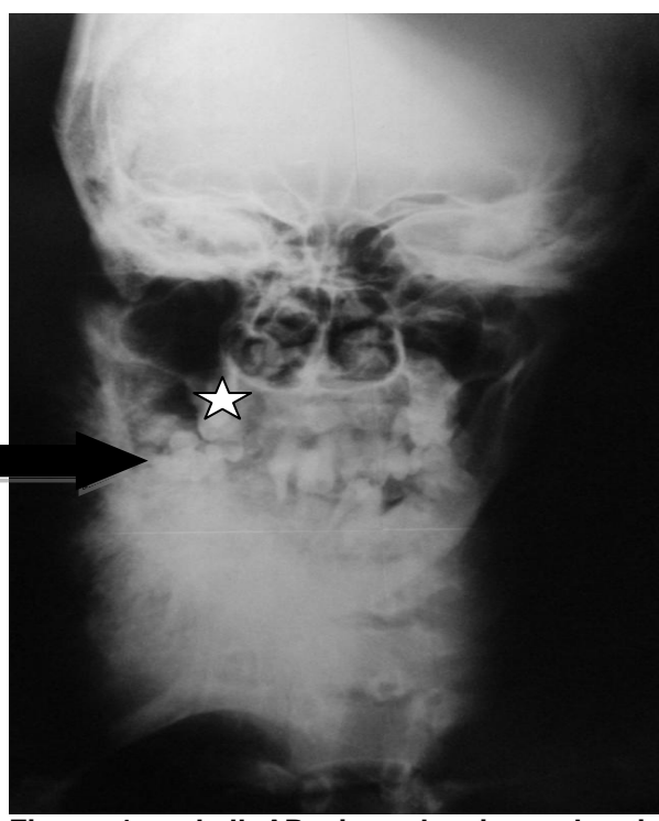
Figure 1: skull AP view showing sclerotic lesion involving the mandible with cortical destruction (star)and extensive sunburst periosteal reaction (arrow).

Osteosarcoma implies to a heterogeneous group of primary malignant tumours affecting bone forming or mesenchymal tissues that have histopathologic features of osteogenic differentiation.[1] Osteosarcoma is a highly malignant bone neoplasm which is a relatively rare disease in the head and neck region. Annual incidence in axial skeleton has been reported to be 1.6 to 2.8 million children under 15 years of age with a female to male ratio of 1.6:1. [2] In the jaw the reported incidence is less than 4%.[3] Osteosarcomas of the jaws show behavioural features that are different from the lesions of other skeleton.