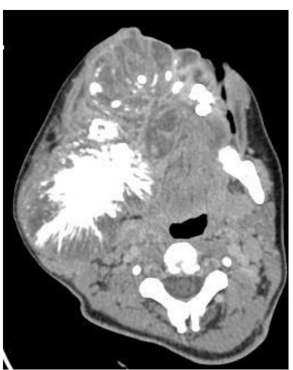
Figure 3: Axial CT image (mediastinal window) showing extensive soft tissue mass with sunburst periosteal reaction.