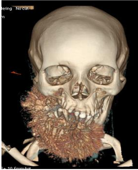
Figure 4b Figure 4a and 4b: Volume rendered image showing the extent of lesion with exuberant sunburst periosteal reaction

These lesions tend to occur at an older mean age (fourth decade versus second decade for non-jaw lesions). [4] Pain and swelling are more frequent in jaw lesions. They rarely metastasize and show a favourable prognosis. [4] Survival rate of 5 years is approximately 40% versus 20% for non-jaw lesions. [4] In the jaws conventional osteosarcomas involving the mandible and maxilla display a predilection for males, some studies display slight