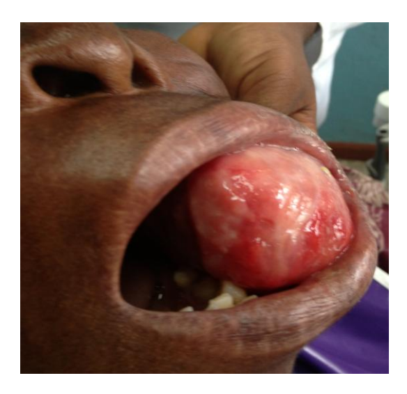
Figure 2: Unusually large pedunculated buccal oral pyogenic granuloma in a 53-year old female patient.

Histopathology: There was similar reporting in all cases, consisting of marked vascular proliferation amidst immature fibroblastic connective tissue, granulation tissue and chronic inflammatory infiltrate (Figure 3).