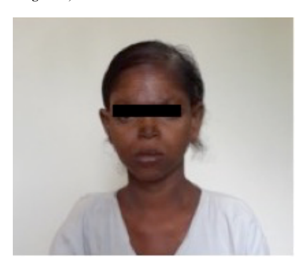
Figure 1: Hypothyroid facies

Examination revealed pulse - 100/min, blood pressure - 70/50 mm Hg, JVP raised with prominent 'x' descent and non-pitting edema of feet. There was presence of facial puffiness also with coarsening of facial features, dry brittle scalp hair, thick lips, dry and scaly skin and hoarseness of voice (features characteristic of hypothyroidism - Figure 1).