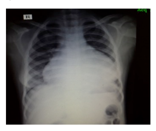
Figure 2: CXR showing Cardiomegaly

ventricular diastolic collapse, suggestive of tamponade with ejection fraction - 25 % (Figure 3).