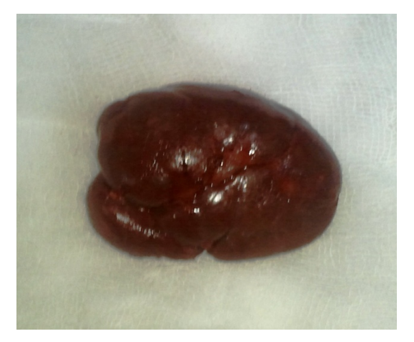
Figure 3: Well defined tumour

Postoperative recovery was uneventful. The patient was given oral liquids after six hours and was discharged the next day. Histopathological examination revealed presence of epithelial sheets within a well defined capsule ( Figure 4 ). The diagnosis was oncocytosis.