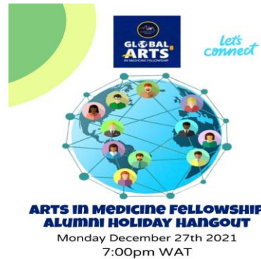
Figure 8 Some Art Therapy Groups

Painting as a creative tool utilizes the brain which is the faculty of thinking. The painter, whether professional, amateur or even curious playing children are delighted when they see people appreciating their works. This also gives them sense of pride and joy in their handy- work. The ego or self-esteem of such people is boosted hence, they happily strive to a higher level of creativity. In this way their emotion is stabilized giving way to a healthy living and healthy society. Practicing and learning creative skills especially