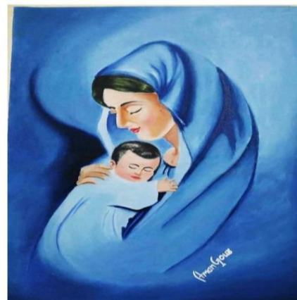
Figure 10: Mother and Child (Kreative hand Studio, 2021)

Painting develops the Spirit of Perseverance: Generally, some well-developed ideas and innovations have