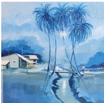
Figure 9: The Blue Landscape (Obaro, 2021)

Painting Boosts Creativity: Paintings like other branches of Art boosts creativity especially with the use of colours and tones. Whatever the technique is, be it abstract, realism, impressionism, expressionism or modernism, painting is a means of artistic communication. Abstract art gives room for total freedom of expression in which the artists is not restricted by any traditional rules to create his piece. The joy of art lies in innovation, creation and recreation of something with one's own hand, and original thing that "reveals one's deepest expressions and motivations.