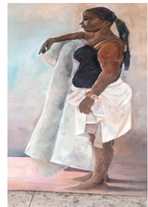
Figure 3: Single figure (Taiwo, 2021)