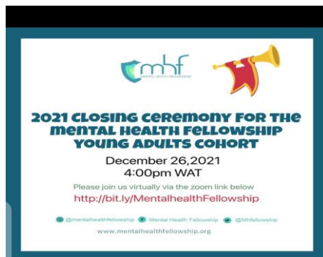
Figure 7: Some Art Therapy Groups

Policymakers, Entrepreneurs and Mental Health and Wellness advocates (Mhf, 2021). Example includes Arts in Medicine, Nigeria, Global Art in Medicine Fellowship, Global Brain Health Institutes.