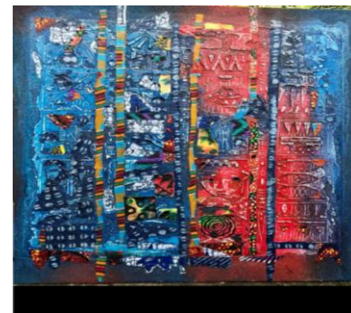
Figure 5: Abstract painting, mixed media (Olatunji-Aguda, 2022)

The human society has been experiencing health related issues for ages. With the fast-rising population globally that has consistently increased from 1 billion in 1800 to about 7.9 billion in 2020 and with the projection that the population will hit 9.7 billion in 2050 health related problems will also increase. (United Nations, 2019) For example Nigeria which currently rank Nigeria as the 6 th most populous country in the world with about 219 million population is projected to hit 440 million population by 2050 (USAID, 2020, US Census Bureau, 2021). Nigeria is