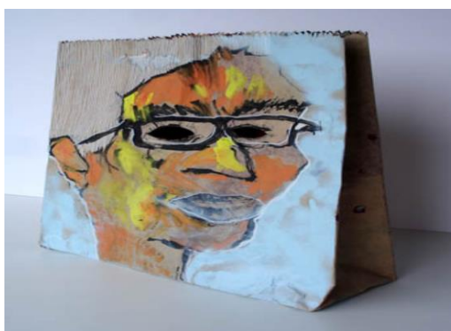
Figure 6: Self Portrait Bag, (www.arttherspy.com , 2021)

freely as possible. Any of the painting materials mentioned above could be used. However, the other side of the bag can be used to express the participant's feelings or ideas apart from the portraiture by painting anything that comes to mind. For instance, one may want to represent his or her fears and dreams, or goals and aspirations. For the inside of the bag one can put items like pictures of things you like, personal items, books, or even some of the future paintings you make.