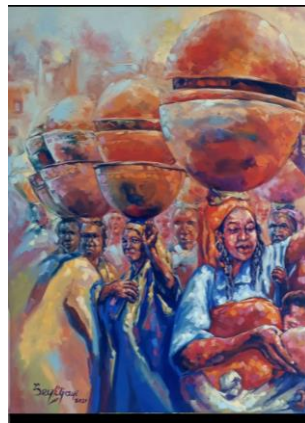
Figure 2: Multiple figure (Ajayi, 2021)