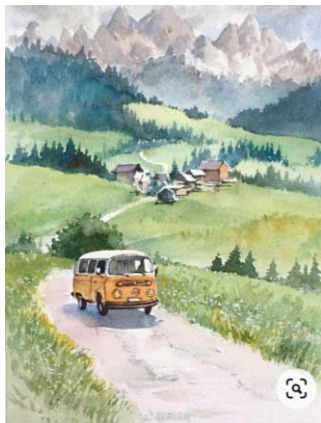
Figure 1: Landscape (Pinterest, 2022)

Painting being an old art practice comes more naturally to artistic right-brain people, however people with left-brain known as analytical left-brainers can also stimulate their creativity too by also practicing painting. (Makanju, 2006, Beginner’s School, 2017).