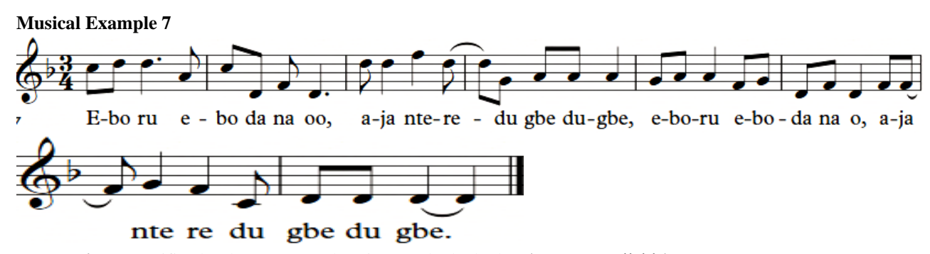
Translation - Sacrifice has been accepted, 'Ajantere dugbedugbe' (nonsense sellable) / 2ce

Step 6: Recessional Song from the Forest/shrine; the recession is a process by which the devotees return from the shrine, forest or river side. The type of song, dance and drumming is dependent on the god who has just been worshipped. It is noted that the returnees increased the volume and display of happiness with their music and dance. The following music examples may be sung while returning from the forest: