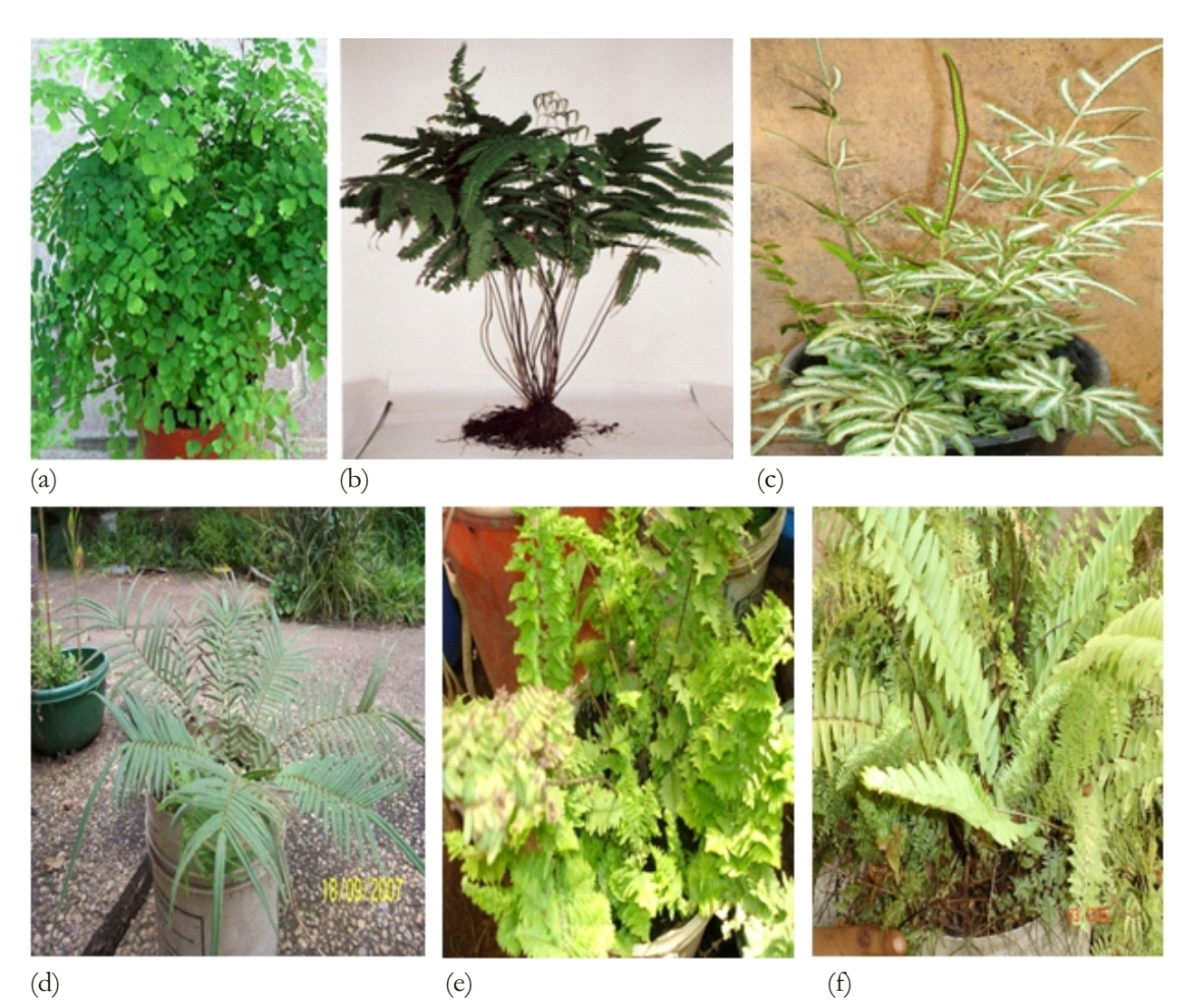
Plate 1. Plant Forms and Habits

MFL=Mean frond length, MFD=Mean frond diameter, MLL=Mean leaflet length, MLB=Mean leaflet breadth