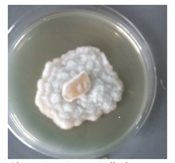
Plate 1: Fusarium verticolloides × 0.5

These were carried out in the pathology laboratory of the International Institute of