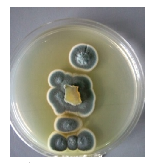
Plate 2: Cercospora sp × 0.5

The results as presented in table 1 show that aflatoxin B1 (AFB1) was present in the garri samples from both open markets. However, aflatoxins B2, G1 and G2 were below the detectable limit of 1 \mu g/kg in all the samples. AFB1 in Uyo samples had a mean value of 3.33 \mu g/kg, a value significantly lower (p<0.05) than the mean value of 21.67 \mu g/kg present in samples from the Oron open market.