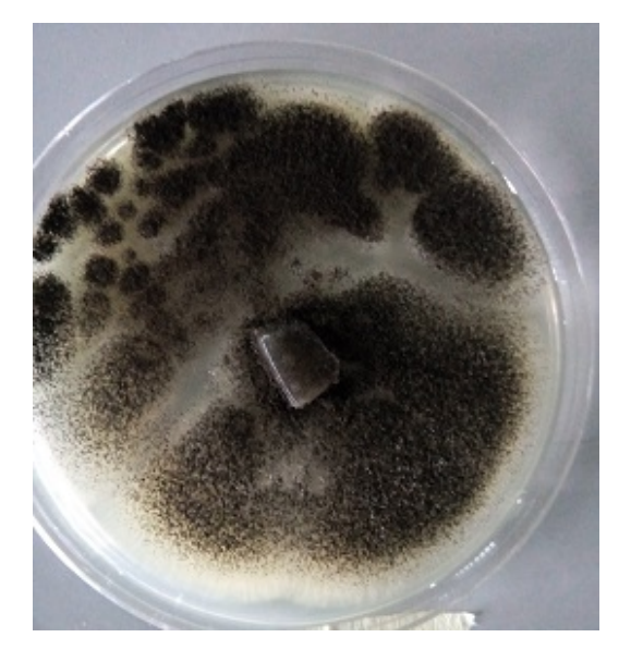
Plate 4: Aspergillus niger × 0.5