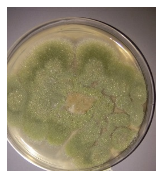
Plate 3: Aspergillus flavus \times 0.5