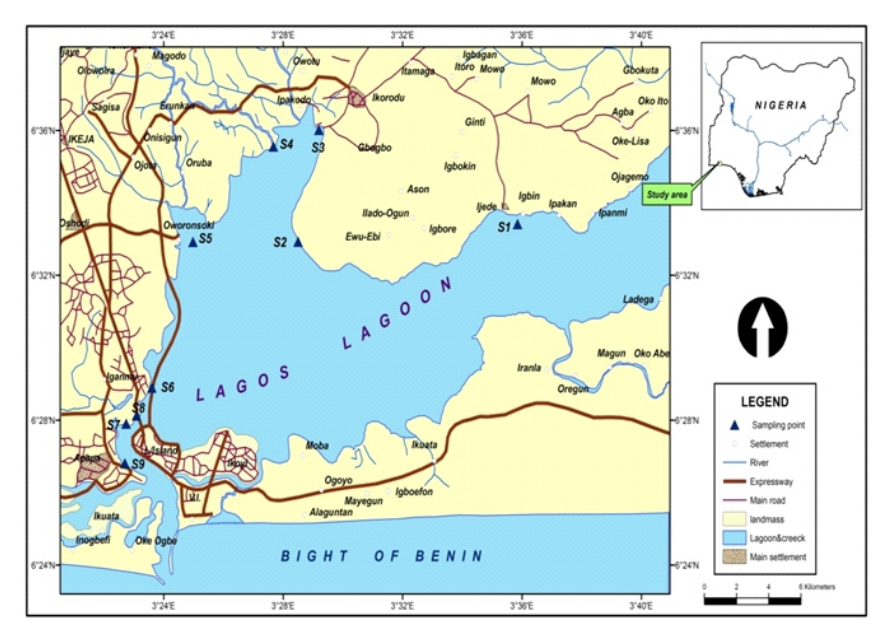
Figure 1: Map of Lagos showing the sampling points on the lagoon