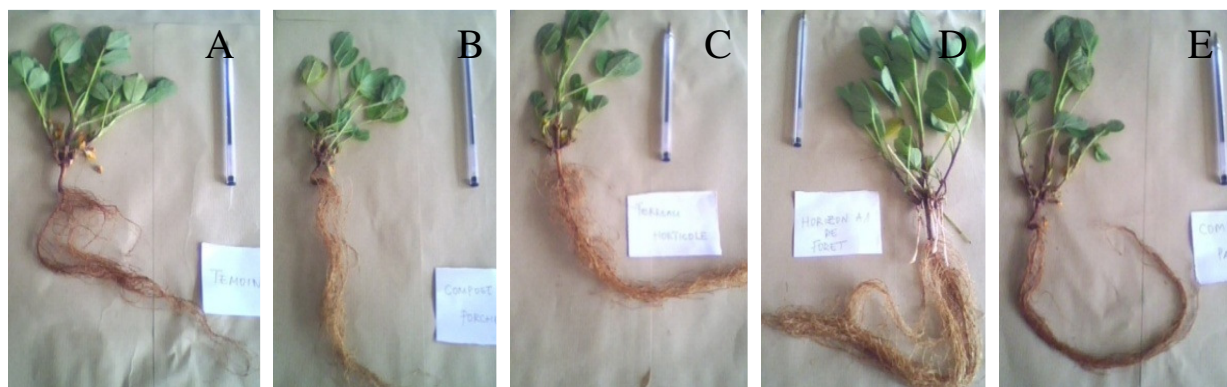
Figure 3: Fresh biomass of groundnuts plants inoculated with LNB inoculants. A. control, B. household organic compost inoculant, C. horticultural compost inoculant, D. forest humus inoculant, E. palm tree inoculant.

strains of different genera often differ in carbon utilization (Tittabutr et al. , 2005). These results can also be justified by the composition of these local carbon and nitrogen sources for LNB growth (Table 3).