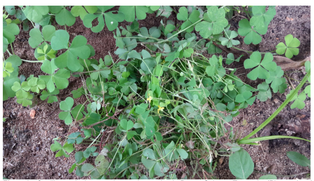
Figure1: Oxallis corniculata growing on the garden in Dar es Salaam, Tanzania.

Quantitative and Qualitative determination of antioxidant activity: All the chemicals used in this work were analytical grade and purchased from Sigma Aldrich Co. (St Louis, MO, USA). The antioxidant ability was analyzed using DPPH radical and antioxidant properties were analysed by determining the polyphenols (Total phenolic compounds, vitamin C, and carotenoids (ß carotene, lycopene) using the methanolic extracts.