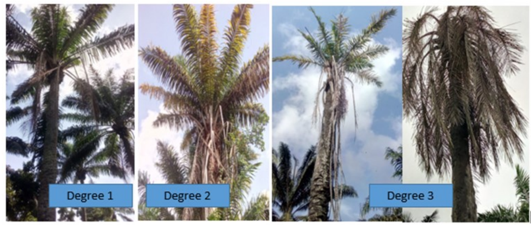
Figure 1: Palm plant showing the symptoms of vascular wilt in Benin