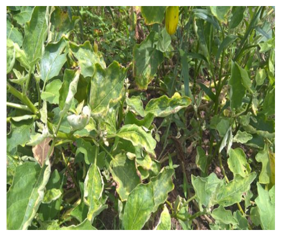
Figure 1: Symptoms on eggplant samples

on the samples from farms are those cause by viruses. The symptoms on sample 11 were mainly yellow mosaic and leaves distortion while the ones on the 5 other samples were mainly leaf curling (Figure 1).