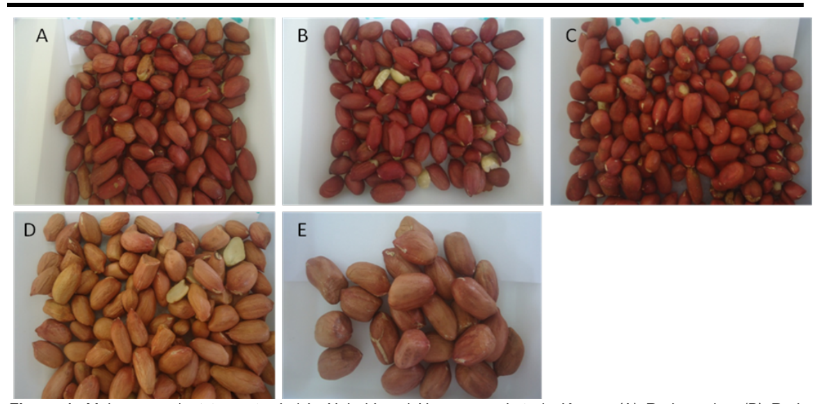
Figure 1: Major groundnut types traded in Nairobi and Nyanza markets in Kenya. (A) Red regular, (B) Red mixed, (C) Red small, (D) Pink regular, (E) Pink large.