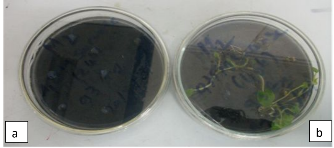
Figure 3: Apices response belonging to accession Da93G1 (a) = non-regenerated apices, b= regenerated apices.

Percentages in the same row followed by the same letters do not differ significantly (p< 0.05).