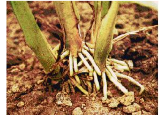
Figure 2: Photo showing secondary roots of sorghum.

such as roots of maize plants and thus confer an advantage in access of water and nutrients from soils (Republic of South Africa, 2010). Roots distribution and root system structure are both affected by soil moisture and play an important role in the plants ability to survive drought situations. Plants having the ability to increase root growth into regions with more available soil water have better chances of survival under drought situations, since increased root growth re-establishes the soil-root contact and facilitates water uptake (Abdulai, 2005).