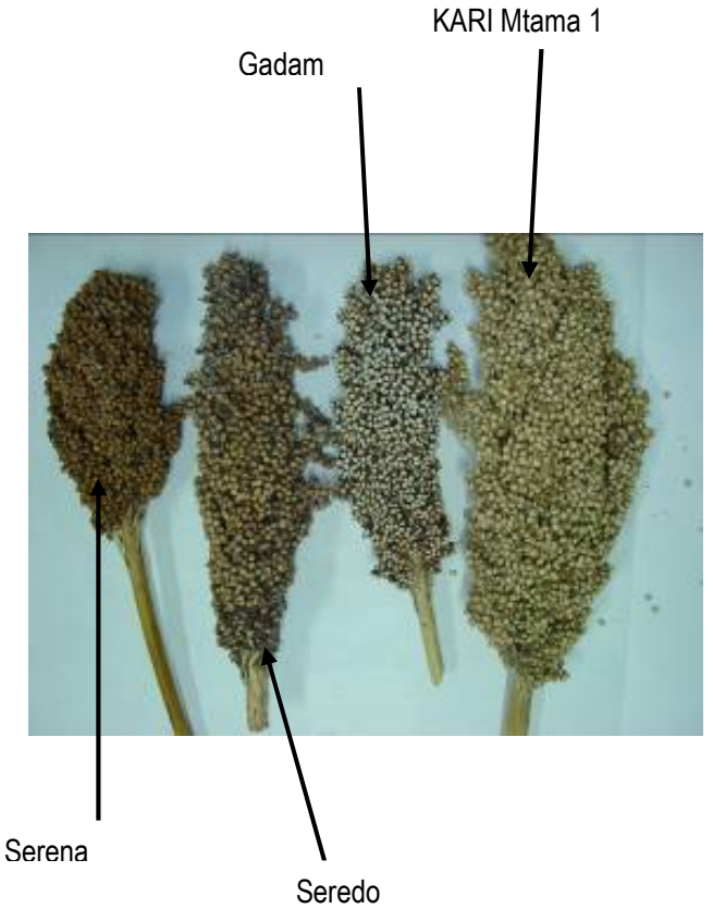
Figure 5: sorghum heads of the four most common sorghum varieties in Kenya, (photo source: KARI, 2006).