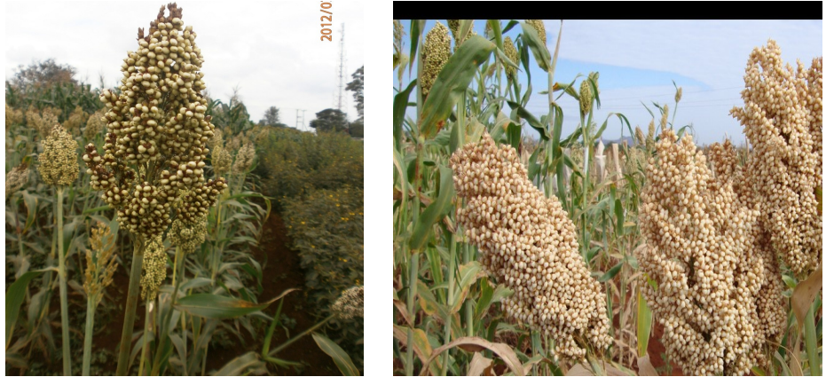
Figure 4: A photo showing Gadam sorghum, (left) and KARI Mtama 1 (right).

approximately 200mm rainfall (Esipisu, 2011). The low current production is due to the low adoption of these improved varieties, low use of fertilizers to boost soil fertility, dietary preferences, and low prices (Miano et al , 2010).