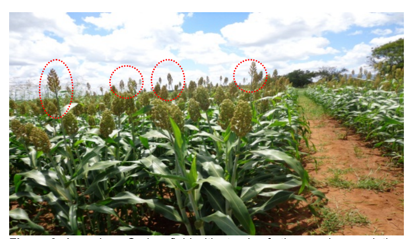
Figure 6: A sorghum Gadam field with stands of other sorghum varieties which were packed with the Gadam seeds. The plants (marked red) are of disproportionate height, (photo source: R. Mwadalu KU).

Seed systems and markets: The agricultural sector development strategy, 2010-2020 also noted that the decline in productivity of orphaned crops was partly arising from low use of improved seeds due to poor distribution systems and the monopoly of the Kenya seed company which concentrates its operations in high rainfall areas (GoK, 2010). The other major problem facing the sorghum subsector is the dominant position of the single market provided by East African breweries for the Gadam sorghum which is widely grown by farmers in the semiarid eastern Kenya. Although EABL has helped to address the problem of marketing, it has led to a situation where farmers do not have an alternative market to sell their surplus produce or grains that do not meet the standards set by EABL. Cases of grains below standard have been encountered due to seed impurities especially mixing of varieties common with commercially supplied seed lots (Miano et al., 2010).