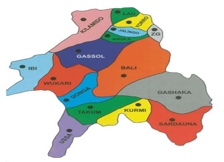
Figure1. Map of Taraba State, Nigeria

and Benue states, Northwest by Plateau and Gombe states, Northeast by Adamawa state and Southeast by Cameroun (Figure 1). Taraba state lies largely within the middle of Nigeria and consists of undulating landscape dotted with a few mountainous features which includes the prominent Mambilla Plateau.