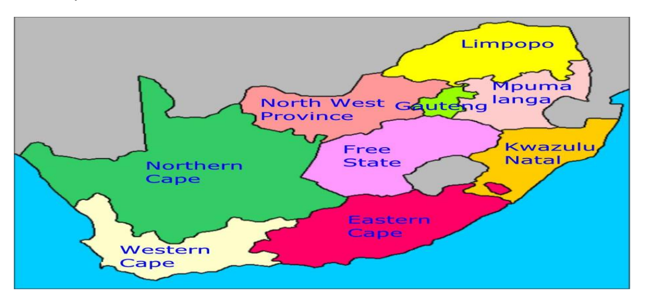
Figure 1: Map of South Africa showing the different provinces.

The Eastern Cape province is located in the south-eastern part of South Africa, noted as the second largest province by surface area, and lies between latitude 32.2968° South and longitude 26.4194° East. It covers approximately 170,000 square kilometres, which comprise approximately fourteen percent of the total land mass in South Africa. The Eastern Cape Province shown in Figure 1, has the highest number of livestock in South Africa (DAFF, 2017), is bordered by the Western Cape, Northern Cape, Free State and Kwa-Zulu Natal provinces, and also shares a boundary with Lesotho.