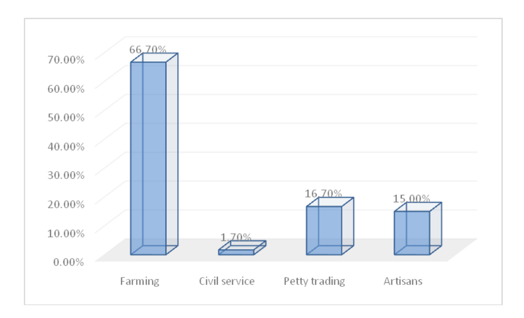
Figure 3: Distribution of respondents based on primary occupation