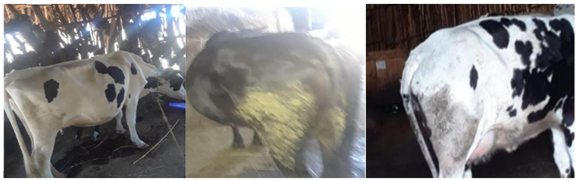
Figure 3: Udder and leg cleanliness of cows

Note: Clean udder and flank (left), dirty udder and flank (middle), medium clean udder and flank (right)