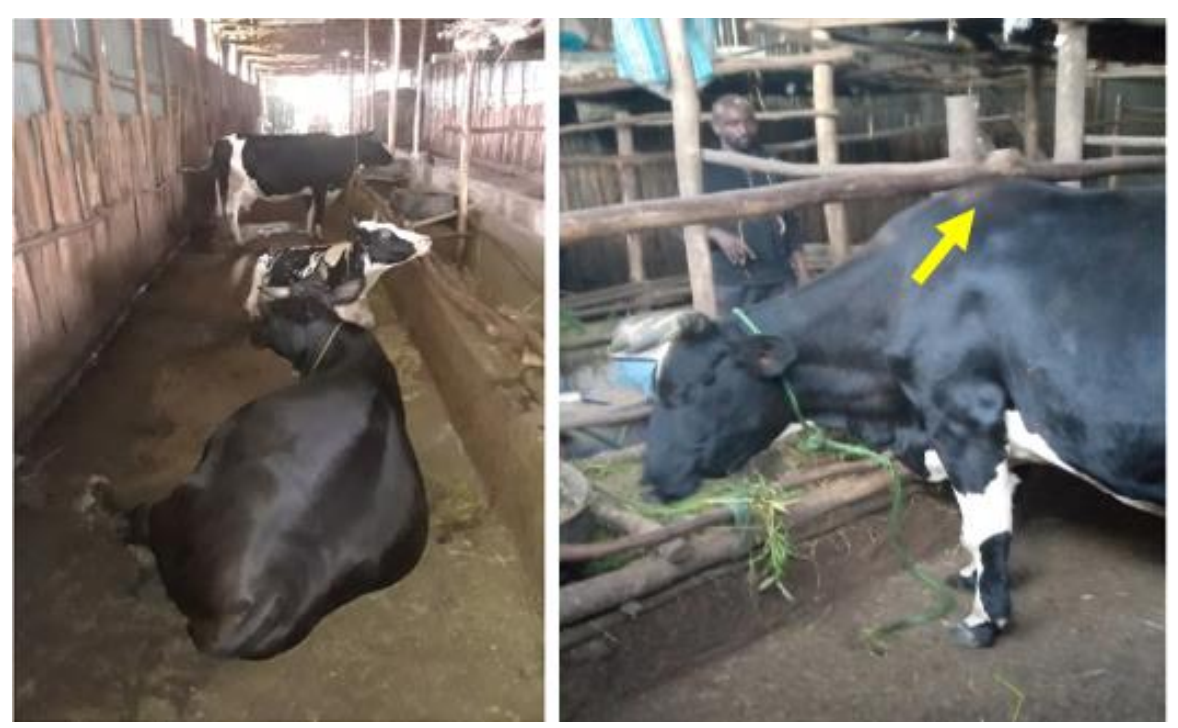
Figure 2: Laying behavior (left) and neck injury (right arrow) of cow