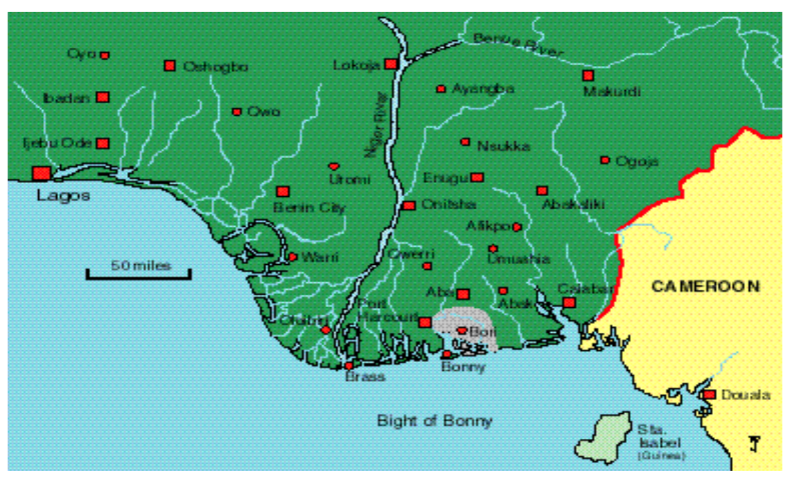
Fig 1. Map of Southern Nigeria showing Ibadan among locations on the far left, while Enugu is on the right.