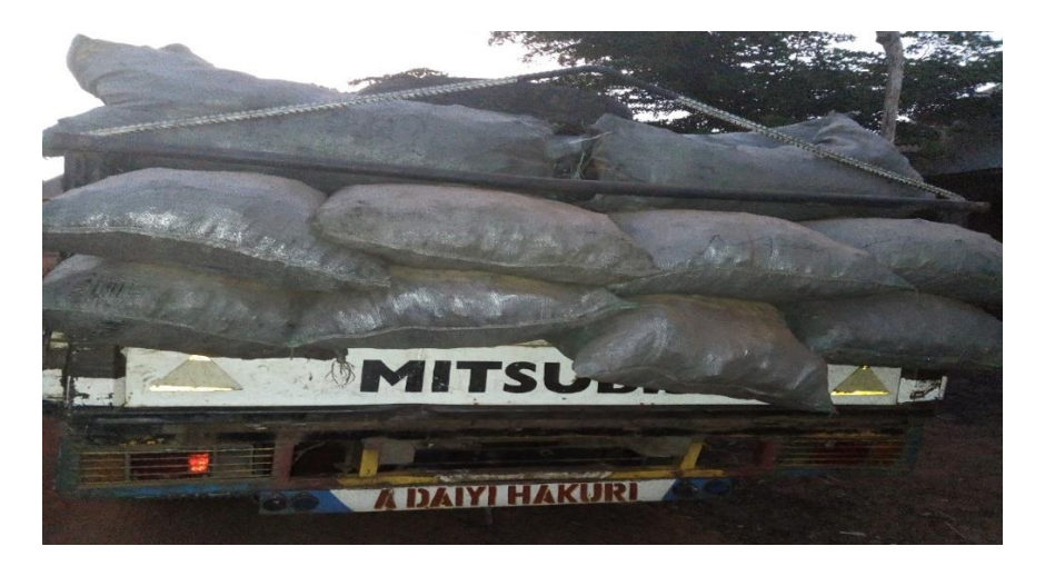
Figure 3: A motor truck loaded with charcoal from Gummi L.G.A Zamfara State to Sokoto State