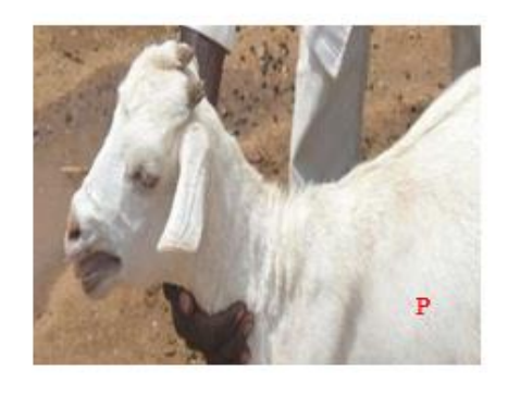
Figure 6, P- Panting goat

Open mouth breathing goats were observed during the study as physiological responses to high temperatures. Panting also known as open-mouth breathing of goats was observed in the afternoon when environmental temperatures were high. (Figure 6). The occurrence proportions of panting Galla goats across Isiolo, Garissa and Tana River and the relationship to environmental temperature was calculated and tabulated. Our study observed low frequencies of panting Galla goats (Table 6).