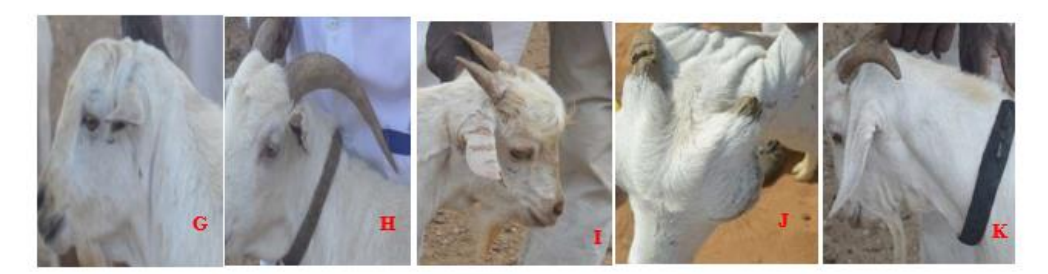
Figure 3. G-polled & horizontal ear, H- curved horn & erect ear, I- straight horn, J- deformed horns, K-floppy ear

Table 3. Proportionate (%) occurrence of horn type, shape and ear orientation traits among Galla goats and their relationship to the outside temperature