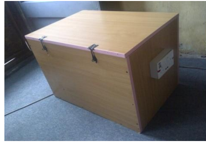
Plate: II The closed soundproof device

Performance evaluation of the soundproof device: 950W rated Honda generator was put on and placed inside the soundproof device and was allowed to run on three quarter load, for 20 minutes and as it was running, the sound level meter manufactured in Taiwan by Exteck Instrument Corporation was switched on and used to measure the sound pressure level in decibel (dB) at distances of 0.70m, 1.4m, 2.1m, 2.8m and 3.5m from the generator five times, with the average value taken for each of five different distances from the soundproof device. The same procedure was repeated when the generator was placed in an open environment.