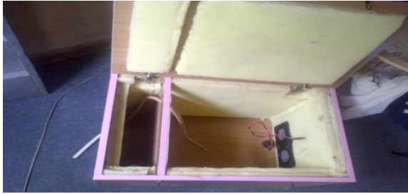
Plate: I The opened soundproof device .