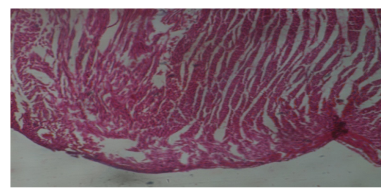
Fig: 3: Histology of heart tissue showing normal architectural features of the heart after treatment with 1.10mg/120gBW of rifampicin for 60days ((400x) H & E staining).

The result from the study showed that the level of triglyceride increased as the duration of drug administration increased. The same trend was found for total cholesterol though the reverse was the trend for HDL. This trend is supported by report of Chen and Raymond, (2005) that rifampicin inhibits CYPA71, a rate limiting enzyme in the conversion of cholesterol to bile acids'. This may account for the increase in cholesterol levels for when they are not converted to bile acids they remain in the blood stream. Piriou et al., (1979) also reported that fatty liver can be induced by very high doses of rifampicin in rat. The determination of total lipids, total cholesterol and phospholipids showed a significant increase in the total lipids, triglycerides and total cholesterol in the liver at a dose of 400mg. The