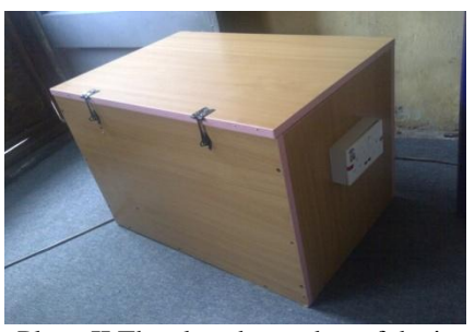
Plate: II The closed soundproof device

It can be seen from figure 1, that the sound pressure level decreases as the distance from the generator increases for both running the generator in an open environment and in the soundproof device. The values of the sound level pressure of the generator