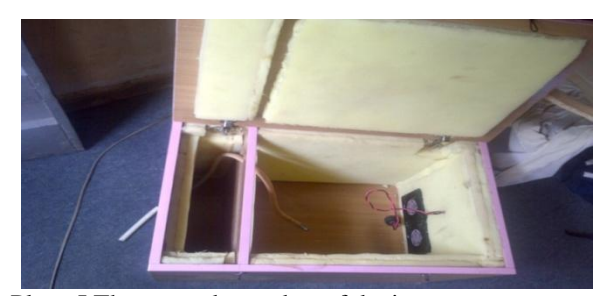
Plate: I The opened soundproof device .

Performance evaluation of the soundproof device: 950W rated Honda generator was put on and placed inside the soundproof device and was allowed to run on three quarter load, for 20 minutes and as it was running, the sound level meter manufactured in Taiwan by Exteck Instrument Corporation was switched on and used to measure the sound pressure level in decibel (dB) at distances of 0.70m, 1.4m, 2.1m, 2.8m and 3.5m from the generator five times, with the average value taken for each of five different distances from the soundproof device. The same procedure was repeated when the generator was placed in an open environment.