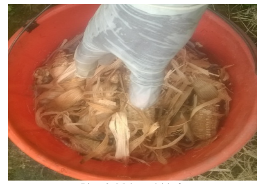
Plate 2: Maize cob/shaft

The design of the termites' laboratory setup is seen in Figure 1. Macrotermes Subhyalinus (Isoptera Termitadae) of termites were collected from the Federal University of Technology, Akure using bait technology. Termite workers fed upon the bait since they forage around for food, they saw the paper bait as food and later in 12 hours especially when there was no rainfall for the space of 2 days, the baits were collected and termites moved into the new laboratory colony designed for them. The termites were fed with the carbon source-maize cob at for a period of 30 days. Plate 1a shows the paper bait used for termite collection. The physical and chemical characterization of the feed stocks (Plate 1b) was determined using procedures for the Standard Test Method for Proximate Analysis of the Analysis Sample of Coal and Coke by Instrumental Procedures (2008).