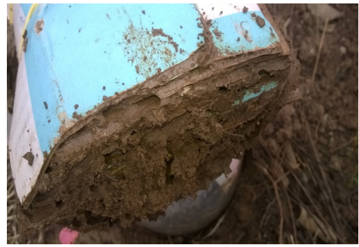
Plate 1: Termites' Bait