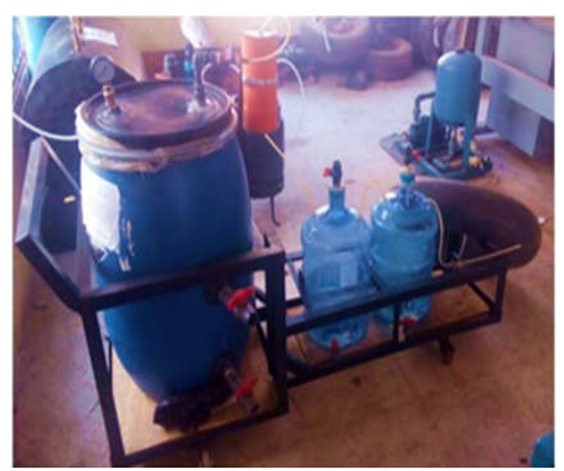
Fig 5: Biogas production and purification system

using rubber hose to pass the produced biogas from one stage to another. The purified biogas was stored in a tyre tube and a carriage was fabricated using a 2mm and 1mm angle bar to make the system mobile.