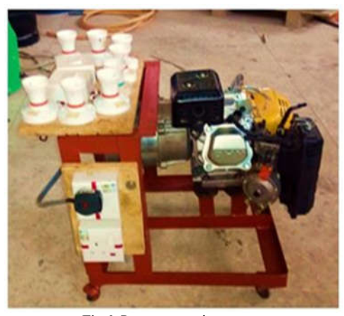
Fig 6: Power generation system.

Figure 6 shows the power generation system, which consists of an internal combustion engine, a low pressure gas carburetor and a synchronous generator. The system uses the GX160 internal combustion engine. It was modified by reconfiguring the carburetor using a low pressure gas carburetor. The synchronous generator was directly coupled to the internal combustion engine. Sockets, lamp holders and switches where wired on a wooden board to get the power output from the synchronous generator. A frame was fabricated using 1.5mm angle bar to sit the internal combustion engine and the synchronous generator. Dampers were used to reduce the vibration produced by the engine. Figure 7 shows the biogas production, purification and power generation system.