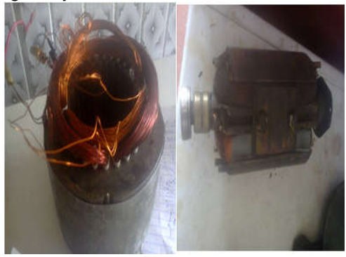
Fig 4: Synchronous generator.

Implementation: The implementation process took place in stages so as to simplify the entire process. The system was constructed in modules as designed and later put together on completion to simplify construction, testing and maintenance. Figure 5 shows the biogas production and purification system. The biogas production system consists of biogas digester constructed using the fabrication process stated in the design analysis.