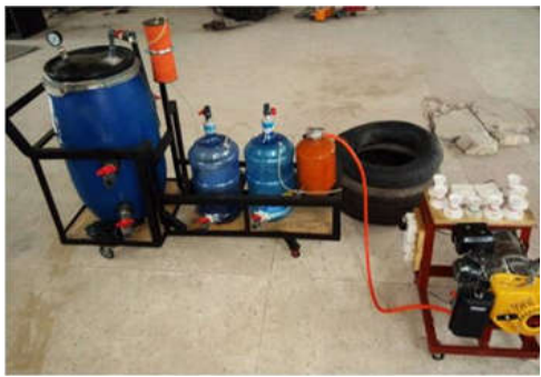
Fig 7: Biogas production, purification and power generation system

The problems encountered in the implementation is as follows: i) Due to the material selection for the fabrication of the bio-digester and purification system, there were gas leakage as a result of built up pressure within the system thereby causing expansion on the material. Thus, this reduced the gas production efficiency of the system. ii) Using biogas to power a conventional gasoline generator converted to function on gas using a low pressure gas carburetor proved a bit difficult as there was a need to always regulate the biogas input pressure when interfaced with the gas carburetor to power on the generator.