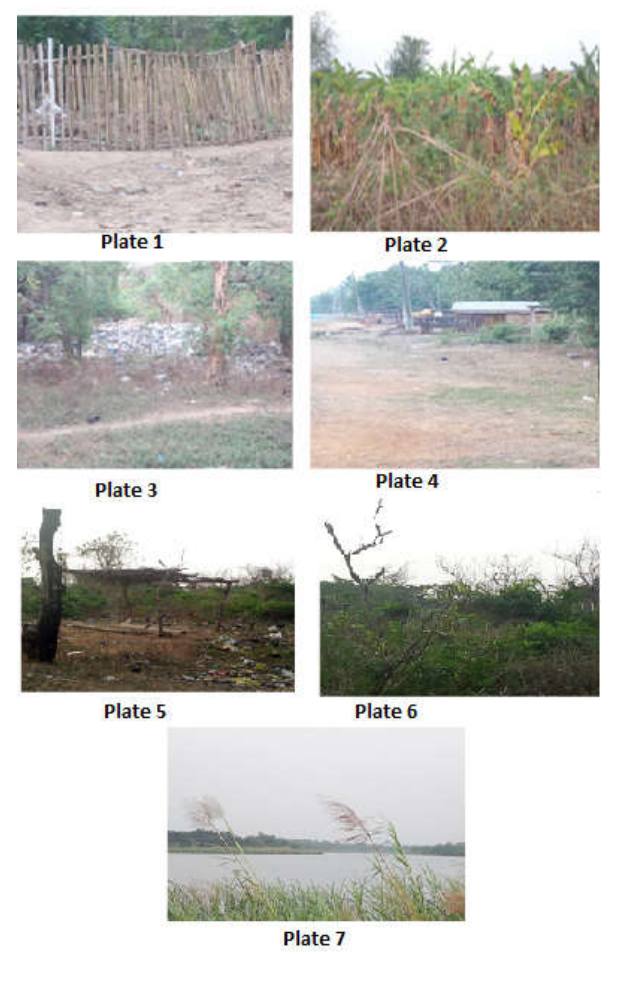
Plate 1: A section of forest near Aiba dam cleared and fenced for cropping. Plate 2: A mix-crop farm adjacent (<50m) to the dam. Plate 3: A refuse dump site near the dam less than 50m away. Plate 4: Section of the forest cleared to build furniture workshop and cafeteria with the dam just few meters away. Plate 5: Burnt site near the dam portend greater exposure to soil erosion. Plate 6: Macroplankton vegetation on protruded isle in the dam. Plate 7: Ageing trees and vegetation changes the microclimate of the dam site.

Data Collection and Analysis: Direct visitation to Aiba dam, desk studies and oral surveys were employed on community stakeholders. Fifty (50) members of the community were randomly selected within the political wards at an average of five (5) per ward purposely for in-depth interview on their perception on the reservoir. The selected respondents: indigenes and non-indigenes, male and females, who have lived in the town for not less than two decades were interviewed. A stakeholder workshop was also conducted at Bowen University to present our findings and get feedbacks needed to ascertain credibility of data obtained. The outcomes of the research effort are thus presented.