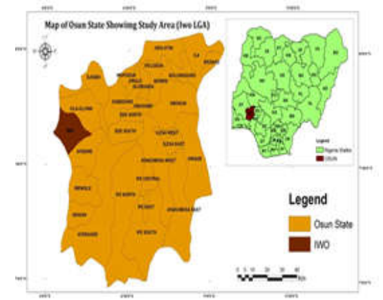
Fig 1: Location of Iwo town in Osun state, Nigeria