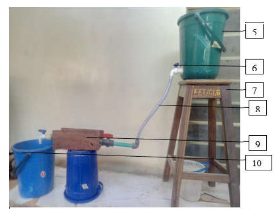
Fig 2. Magnetic treatment unit for the wastewater: Legend: 5 = Storage tank, 6 = control tap, 7 = stood, 8 = hose, 9 = magnetic field unit, 10 = collector for the wastewater

Parameters assessed from the wastewater: The parameters assessed were the physical, chemical and bacteriological properties of the wastewater. The parameters assessed in the wastewater were the turbidity, pH, dissolved oxygen (DO), biochemical oxygen demand (BOD<sub>5</sub>), chemical oxygen demand (COD), ammonia nitrate, sulphate ion, electrical conductivity, alkalinity and total coliform. The parameters were determined using the standard methods given by the American Public Health Association (APHA) (2005).