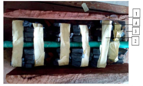
Fig 1. Arrangement of permanent magnet on the PVC pipe for the wastewater treatment: Legend: 1 = wooden housing, 2 = paper tape, 3 = 0.5 inch PVC pipe, 4 = permanent magnet

The third portion of the wastewater after passing through magnetic field, it was poured into the transparent 5 litres capacity gallon (6 gallons, 2 for each moringa dosage) and 100, 150, 200 mg/L moringa seed powder were added to the wastewater. The wastewater with the moringa seed powder was then stirred rapidly for 1 minute, then, slowly for another 10 minutes. The treated wastewater was allowed to settle down for 2 hours before samples were taken for analyses. The fourth portion was the control experiment which was neither treated with moringa seed powder nor the magnetic field.