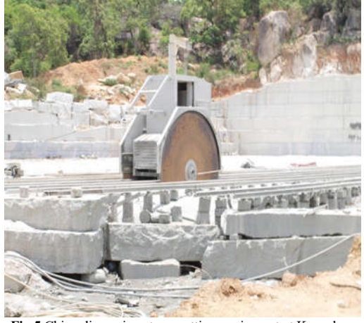
Fig 5.China dimension stone cutting equipment at Kporokpo village in Lokoja area, Nigeria

Figures 6 and 7 are the primary cut migmatites and granite gneisses before transportation to the processing plant through water or land. While the components of the dimension stone equipment at the mine was being explained by the operator in Figure 8. The cut and polished dimension stone are shown in Figures 9 and 10 in floor tiles. The use of the materials for walls is increasing as it requires no painting but washing to clean dust after the dry season and green algal growth after the raining season.