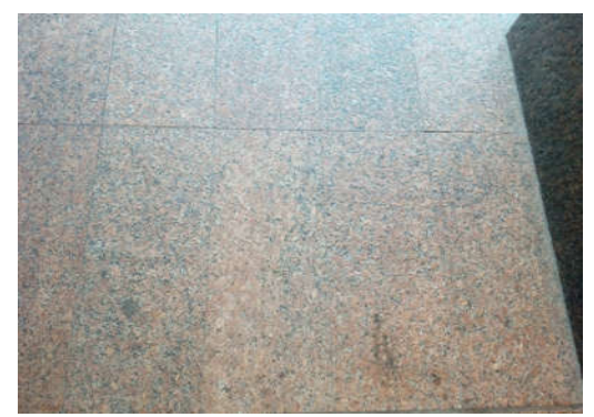
Fig11.Cut and polished biotite granite at Eko Hotels Lagos

The study area has received exploration surveys by the Geological Survey of Nigeria (GSN) from workers like (Hockey et al. , 1986). The details of the geology of the area can be obtain from the Geological Survey series Bulletin 39. There is an abundance of rocks like charnockite, marble, quartzite, granite, sandstone, gneiss and slate which can be prospects in the area and also comparable with rocks in places like India, Italy, Spain, Israel and Brazil.