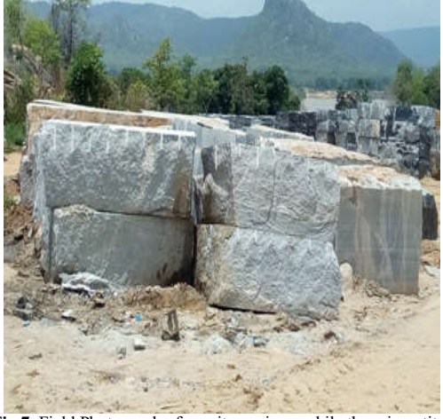
Fig 7. Field Photograph of granite gneisses while the migmatites and river is behind