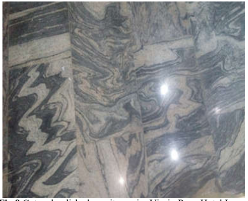
Fig 9.Cut and polished granite gneiss Virgin Rose Hotel Lagos

The results are shown on table 2, while table 3 indicates the need for a trained geologist for sustainable dimension stone production. Figures 9 - 10 are cut and polished gneisses and migmatites which are similar to the rocks cut for dimension stone production in the study area, while Figures 11 -12 are granites and charnockites which are present and in abundance in the study area but are yet to be invested in production of dimension stone.