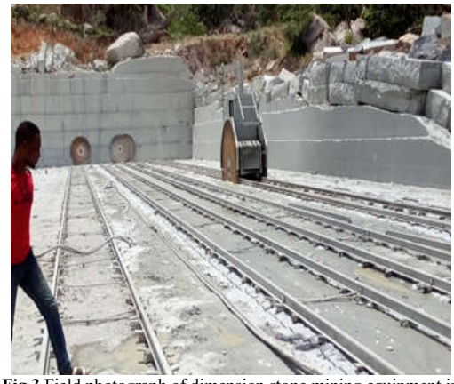
Fig 3.Field photograph of dimension stone mining equipment in operation

Dimension stone can be separated by more precise and delicate techniques, such as diamond wire saws, diamond belt saws, jet-piecers, or light and selective blasting with primacord, a weak explosive. Figures 3 and 4 below are the rocks and cutting edge machine which help the dimension stone exploration and production company trying to meet the huge demand in stone production and use, they are Chinese dimension stone mining equipment in operation at the Kporokpo site in Lokoja, Nigeria. The depth of the mine is about 7m.