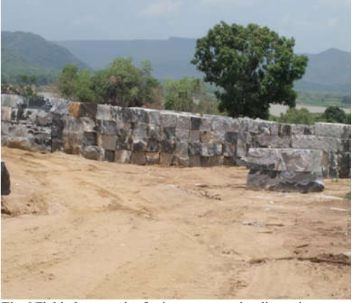
Fig 6.Field photograph of primary cut gneiss dimension stone migmatite parked before moving to secondary cutting and polishing plant.

Figures 6 and 7 are the primary cut migmatites and granite gneisses before transportation to the processing plant through water or land. While the components of the dimension stone equipment at the mine was being explained by the operator in Figure 8. The cut and polished dimension stone are shown in Figures 9 and 10 in floor tiles. The use of the materials for walls is increasing as it requires no painting but washing to clean dust after the dry season and green algal growth after the raining season.