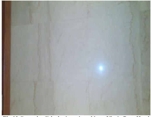
Fig 10.Cut and polished migmatite schist at Virgin Rose Hotel Lagos

Table 1 is the result from some tested rocks in Boki area southeastern Nigeria showing Aggregate Abrasion Value (AAV), Aggregate Crushing Value (ACV), Aggregate Impart Value (AIV) and Absorption in percent, using British, American and German Standards, while table 2 is the present study in Lokoja area, Northcentral Nigeria. A comparison of the two tables shows that Aggregate Abrasion Value (AAV), Aggregate Crushing Value (ACV), Aggregate Impart Value (AIV), Absorption in percent, Rock Strength (MPA), Rock Class Factor and Swell Factor are within acceptable limits except for migmatites which is above the standard limit. The specific roles of