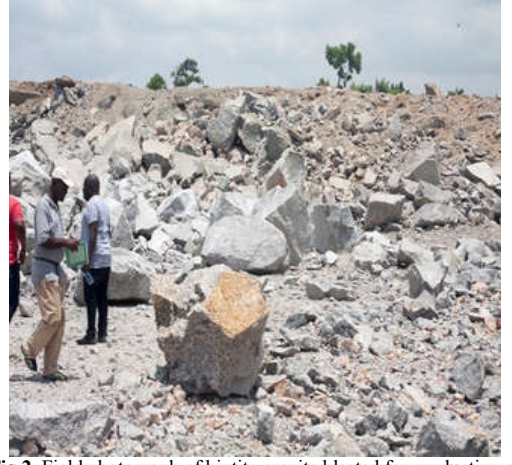
Fig 2. Field photograph of biotite granite blasted for production of aggregates at Kporokpo village.

were made to obtain some drilling and blasting parameters, rock strength testing information such as diameter of spacing and burden. Unfortunately, most of the companies who accepted to answer our questions restricted us from publishing some of the data given to us. Figure2, is a field photograph of biotite granite which has been blasted for the production of aggregates for pavement construction which can be use also in dimension stone production.