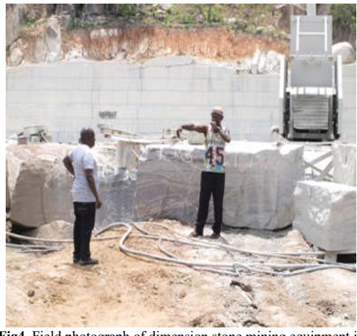
Fig4. Field photograph of dimension stone mining equipment in operation at Lokoja Nigeria

The procedure for dimension mining is quite different from aggregates quarrying. For aggregates the drilling of holes for blasting could be staggered, square, or rectangular, while lines which are square or rectangular are for dimension stone production. In the mine, some of the cut dimension stone are 1m<sup>2</sup>, while many are rectangular in shape. The size of the rail shape design for the primary stone production is 1m at the mine as shown Figures 3, 4 and 5.