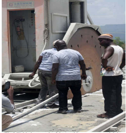
Fig 8 .Field photograph of the machine operator explaining components of dimension stone cutting machine at Kporokpo site.