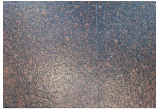
Fig12.Cut and polished charnockite at Eko Hotels Lagos

These countries are among the largest producers and leading exporters of dimension stone in the world. They are obtain and used in iconic buildings all over the world, Indian stone meets the most exacting world standards like durability, appeal and ease of maintenance. The Lokoja area has marbles, granites, migmatites and granite gneisses that are good and will meet world standard. The results of the rock strength analysis from tables 1 and 2 are comparable for granites and granites gneisses but not for migmatites, which is 36% Egesi and Tse (2012), (Egesi and Ukaegbu, 2013) in theBoki area southeastern Nigeria and (Nwosu, et al. 2019) and Nwosu, et al. (in press) in the Lokoja area Northcentral Nigeria. There is need for investment in dimension stone production to reduce the present dependence on large scale importation and also create employment opportunities in the states that have comparative advantage on