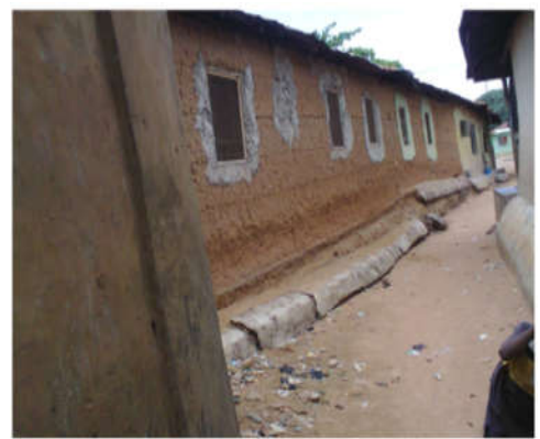
Table 2 : Size of Household An example of building built with mud wall and iron roof Sources: Field work 2018