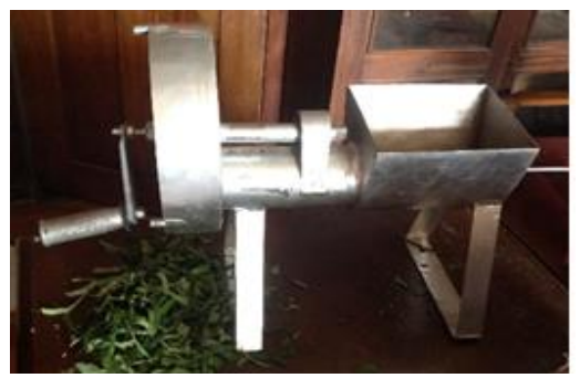
Fig 3. Machine with sliced vegetables

The vegetable slicing machine as designed and manufactured is effective and efficient in its function. Dimensions of 10 samples of the original vegetable leaves were taken before being sliced. Also dimensions of the sliced vegetable leaves from the machine were taken. The experimental results are as shown in Table 2.