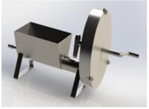
Fig 2. Assembled Machine