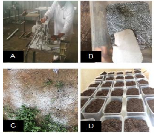
Fig. 1: Aluminum particles yield at a fabricator's workshop (A), collected Aluminum debris (B), soil contaminated with Aluminum particles in ambient environment (C), and five replications of control soil as well different concentrations of Aluminum spiked on soil in exposure vessels (D).

Soil preparation and exposure of earthworm: Aluminum particles of \leq 150mm diameter were obtained by passing Aluminum dust through an appropriate sieve and later spiked on soil at concentrations of 0.32g/kg, 0.63g/kg, 1.25g/kg, 2.5g/kg, 5.0g/kg and 10g/kg. For each treatment level, a corresponding quantity of Aluminum particles was measured into a 2kg of dry weight soil and thoroughly mixed for two days prior to dispensing the treated soil mixture into five replicate exposure vessels (Fig. 1). Prior to replication and after spiked soil had been mixed thoroughly, the treated soil was allowed a twoweek stabilization time at room temperature in the laboratory.