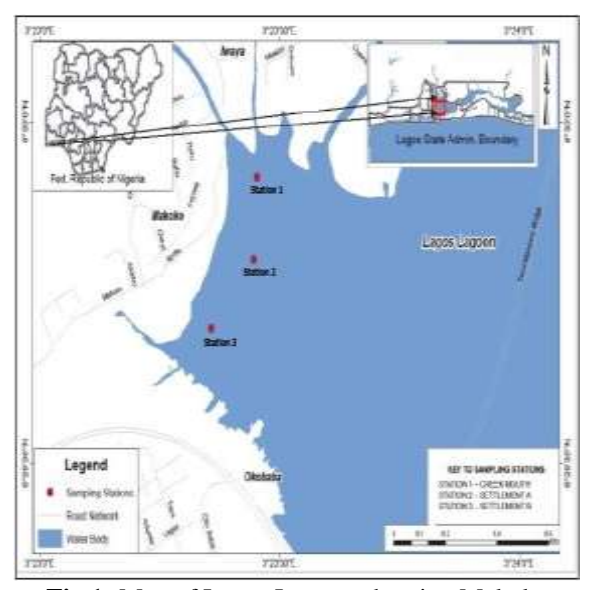
Fig 1: Map of Lagos Lagoon showing Makoko sampling Stations

were homogenized using sterile mortar and pestle; after which they were transferred into different aluminum foil and labeled appropriately. The samples were kept in a refrigerator at a temperature of 4 - 8 °C prior to further analysis.