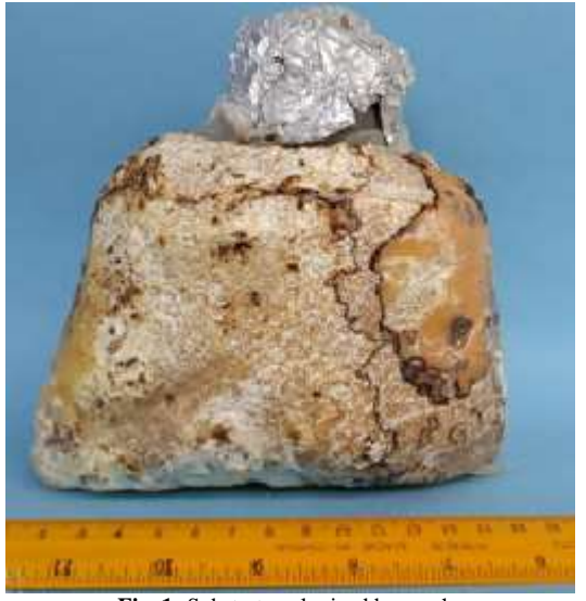
Fig. 1: Substrate colonized by mushroom.

Method for Mycofiltration: Sterilized sawdust was bagged, inoculated with the mushroom spawn and allowed for 1-2 weeks to colonize the substrate. After the third week, the colonized substrate (Fig. 1) was ready for mycofiltration.