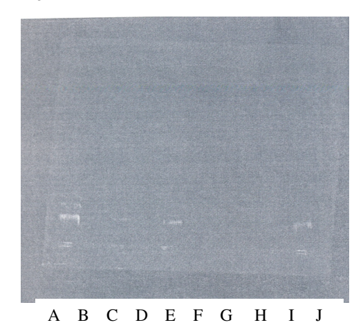
Fig 2: Separation of DNA Molecular weight on agarose gel stained with ethdium bromide (2). Line A = standard bacteriophage lambda DNA fragments, Line B, C, D, E, F, G, H. I, J are DNA fragments of test isolates.

Characterization of plasmid DNA by Agarose gel electrophoresis:-