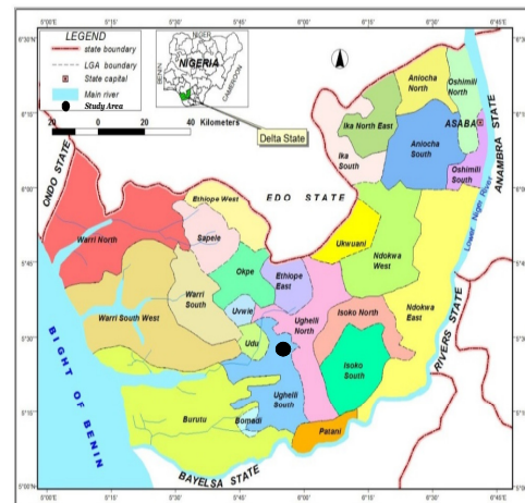
Fig 1: Map of Delta State showing the study area

Leachate Sample Collection: Water samples from four (4 boreholes) locations, one each close to the dumpsites were collected using 1.5 liters plastic containers. Impurities were removed from the plastic containers by soaking it with little quantity of citric acids and thoroughly shaken and rinsed with distilled water in order to prevent contamination and was put to use after the container had dried off. In the respective dumpsites, each of the plastic containers were rinsed with liquid that are to be collected evenly before collection and then sealed. The samples were sealed when filled with water, labeled and stored in an ice block cooler at room temperature to reduce vaporization and deficiency of dissolved gases from the water.