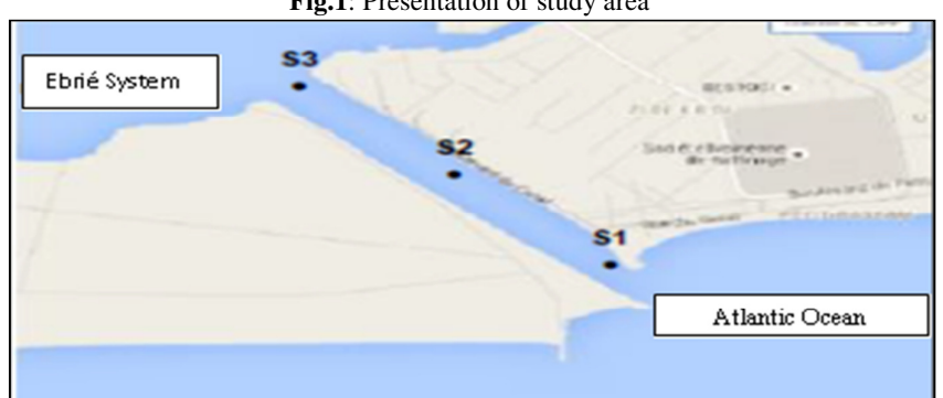
Fig. 2: Location of the sampling sites in Vridi channel

Data evaluation : The assessment of metal pollution level in sediments of Vridi channel was done taking into account 4 pollution indicators: the index of geo accumulation (Igeo), the contamination factor (CF), the enrichment factor (EF) and the pollution load index (PLI).