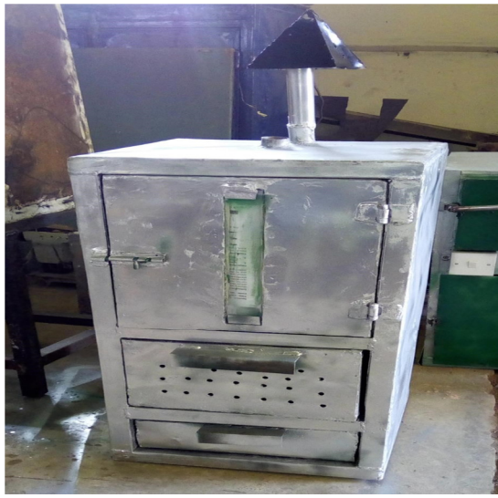
Fig 2: Pictorial view of Sawdust Fired Oven