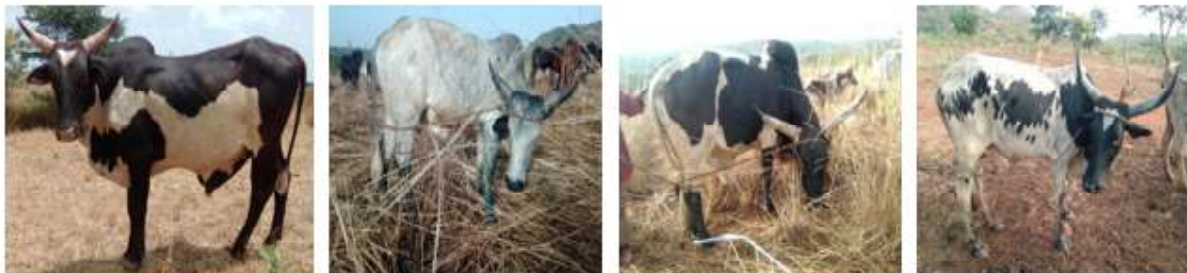
Photo. Some Banyo Gudali varieties