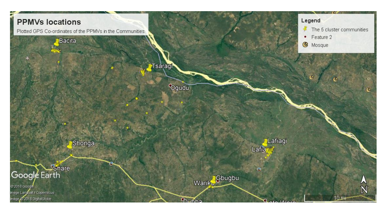
Figure 2: GPS location of the study areas/PPMVs shops as shown on Google Earth Map