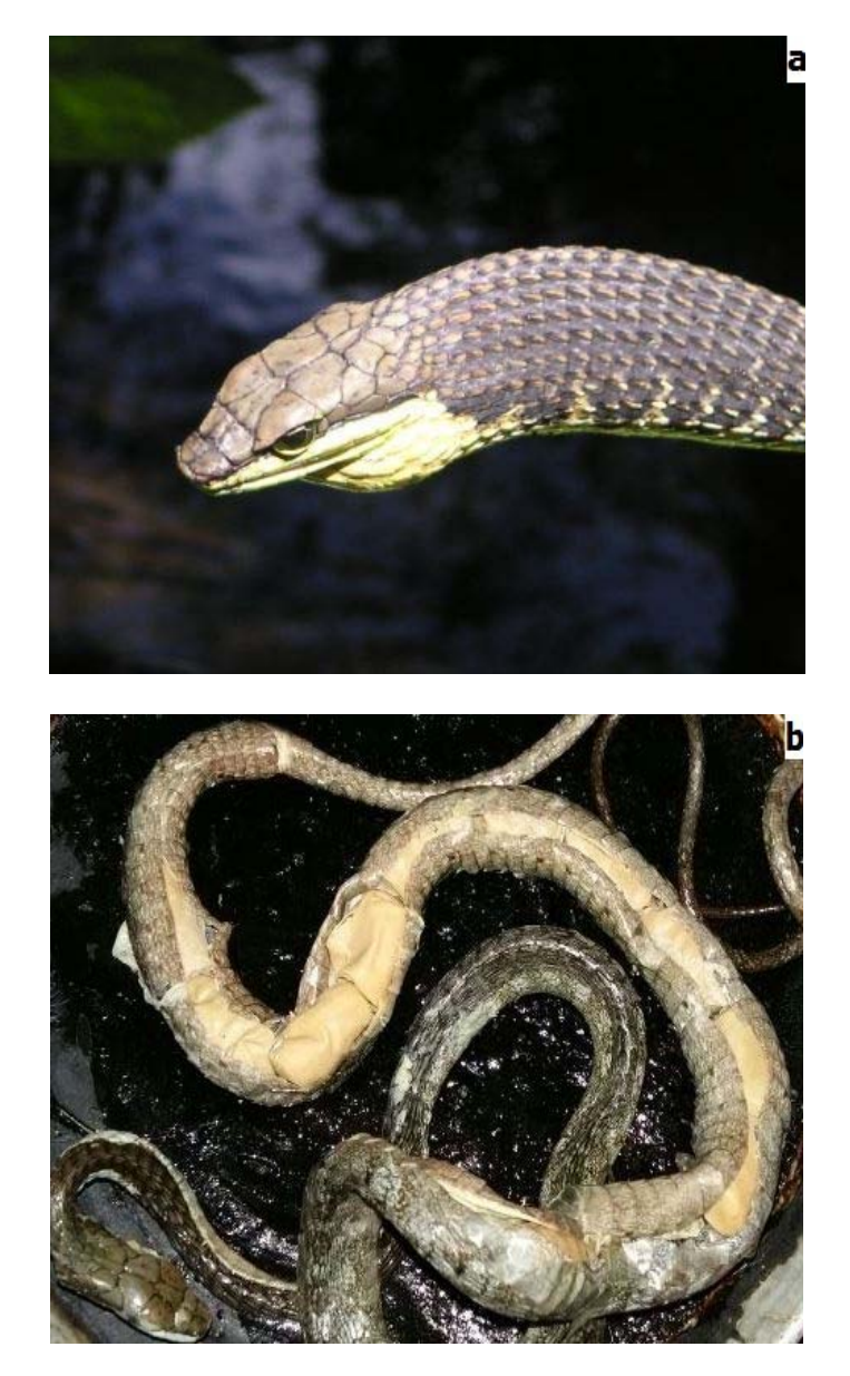
Figure 2: Xyelodontophis uluguruensis from Uzungwa Scarp Forest Reserve; a- specimen from site 1 and b- a preserved specimen collected near site 2 showing eggs in its oviduct.