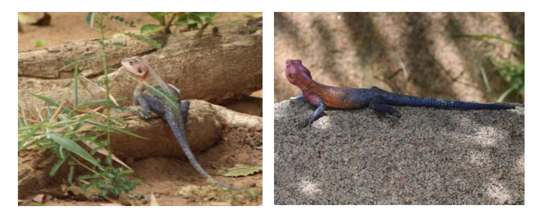
Figure 1. Mwanza flat-headed rock agama Agama mwanzae.

Tanzania is recognized worldwide as a mega diversity nation, and a vital country for African biodiversity conservation (Shemweta & Kideghesho, 2000; Razzetti & Msuya, 2002). Reptiles are no exception to Tanzania's biodiverse portfolio. Razzetti and Msuya (2002) reported more than 275 reptile species, with the majority being endemic to Tanzania and reported on the IUCN Red List of Threatened Species. One well-known East African endemic species is Mwanza flat-headed rock agama Agama mwanzae Loveridge, 1923 (figure 1).